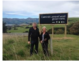
Camira Fabrics, WNZ customer and brand partner, winner of the Queen's Award for Enterprise in Sustainable